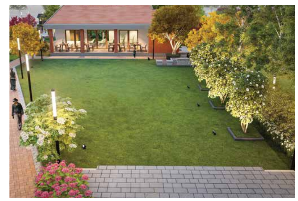
Multipurpose Hall with Party Lawn