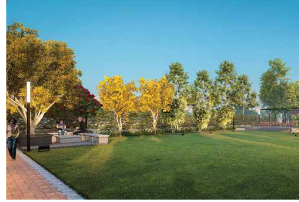
Party Lawn & Barbeque