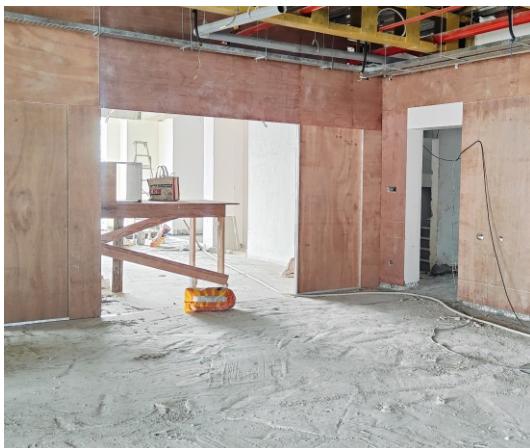
14th floor typical lobby interior work in progress.