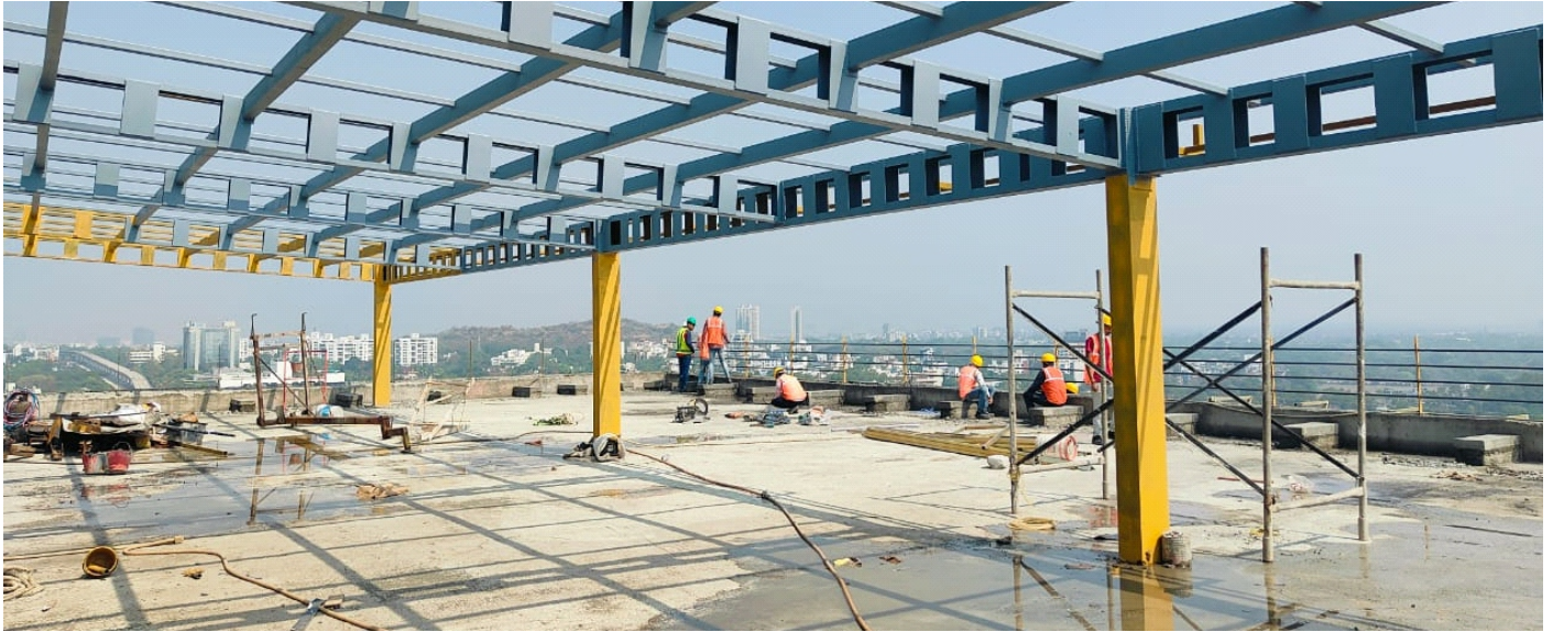
Cafeteria fabrication work in progress.