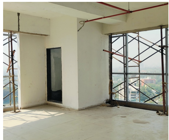
Waterproofing, flooring, and putty work in progress on the 15th floor.