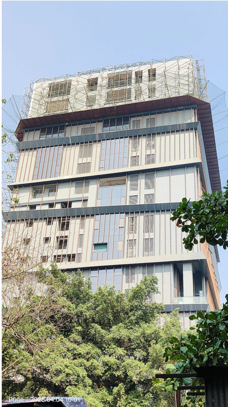
Facade work in progress on the 13th and 14th floors.