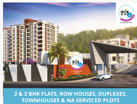
2 & 3 BHK FLATS, ROW HOUSES, DUPLEXES, TOWNHOUSES & NA SERVICED PLOTS