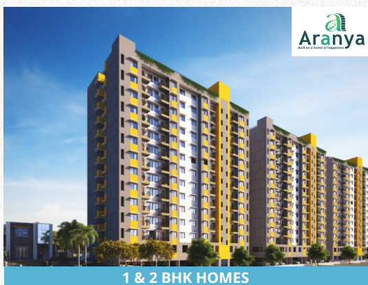
1 & 2 BHK HOMES