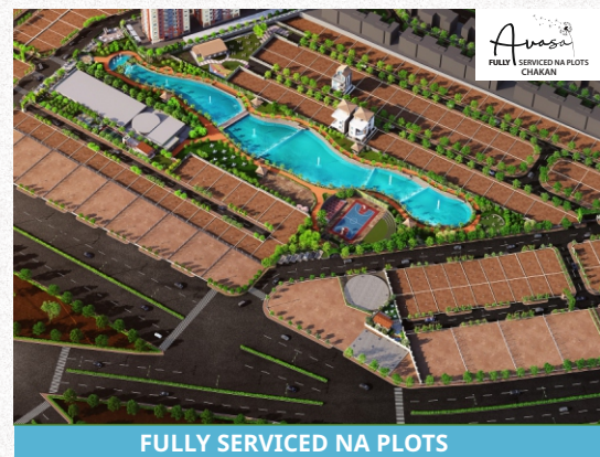
FULLY SERVICED NA PLOTS