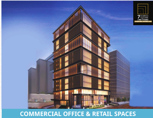
COMMERCIAL OFFICE & RETAIL SPACES