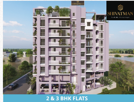
2 & 3 BHK FLATS