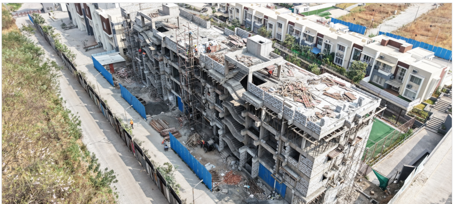
Construction update - Back View