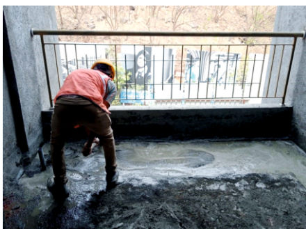
2 nd Floor waterproofing in progress.