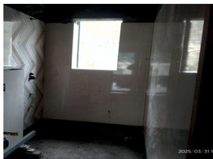
2 nd Floor toilet dado work in progress.