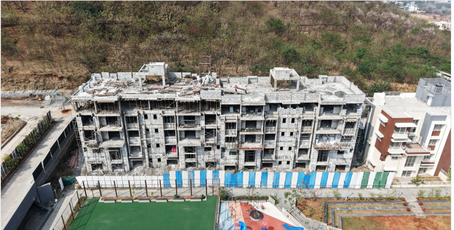
Construction update - Front View