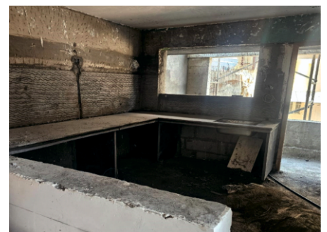
2 nd Floor Kitchen platform work in progress.