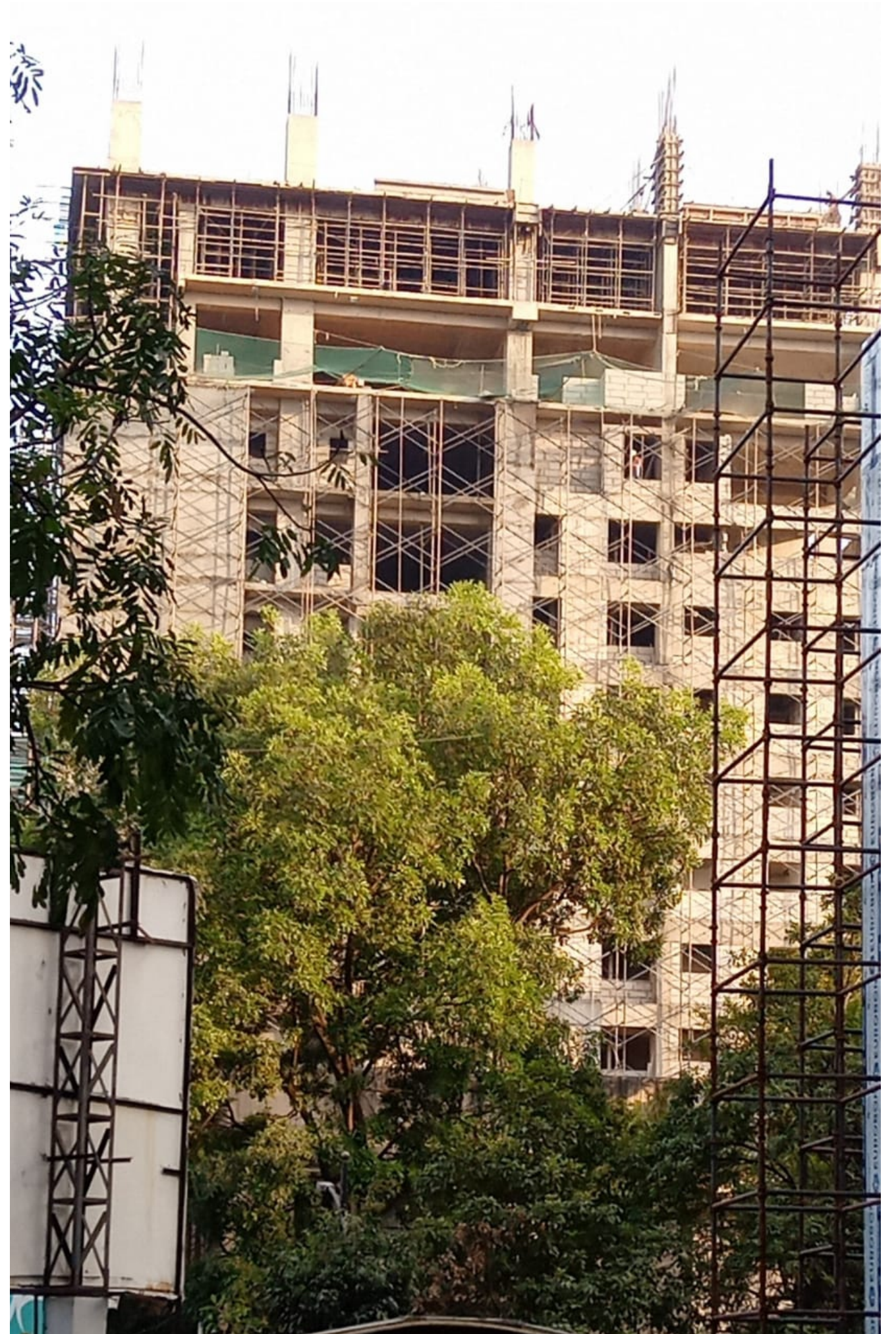
EAST SIDE VIEW