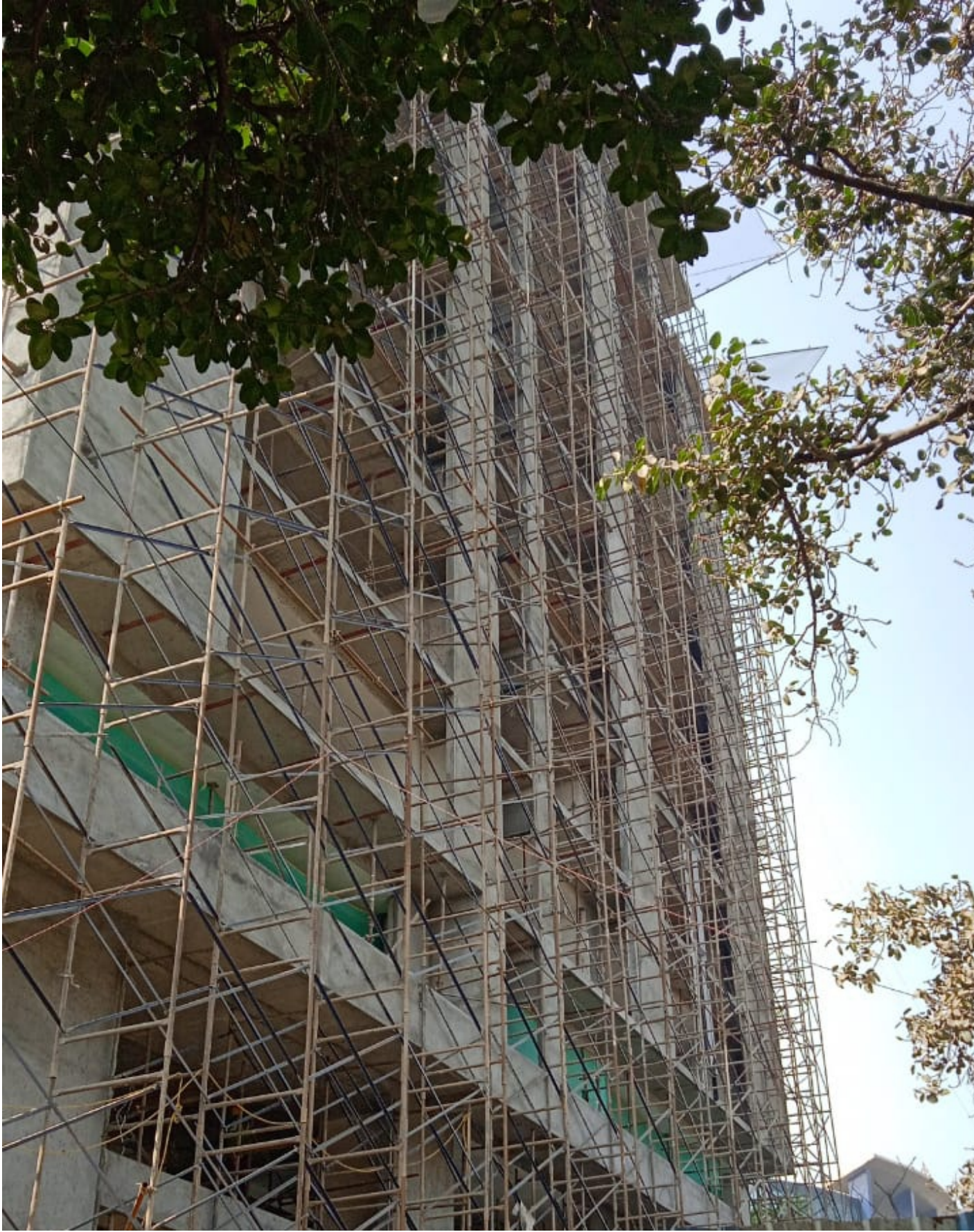
NORTH SIDE VIEW