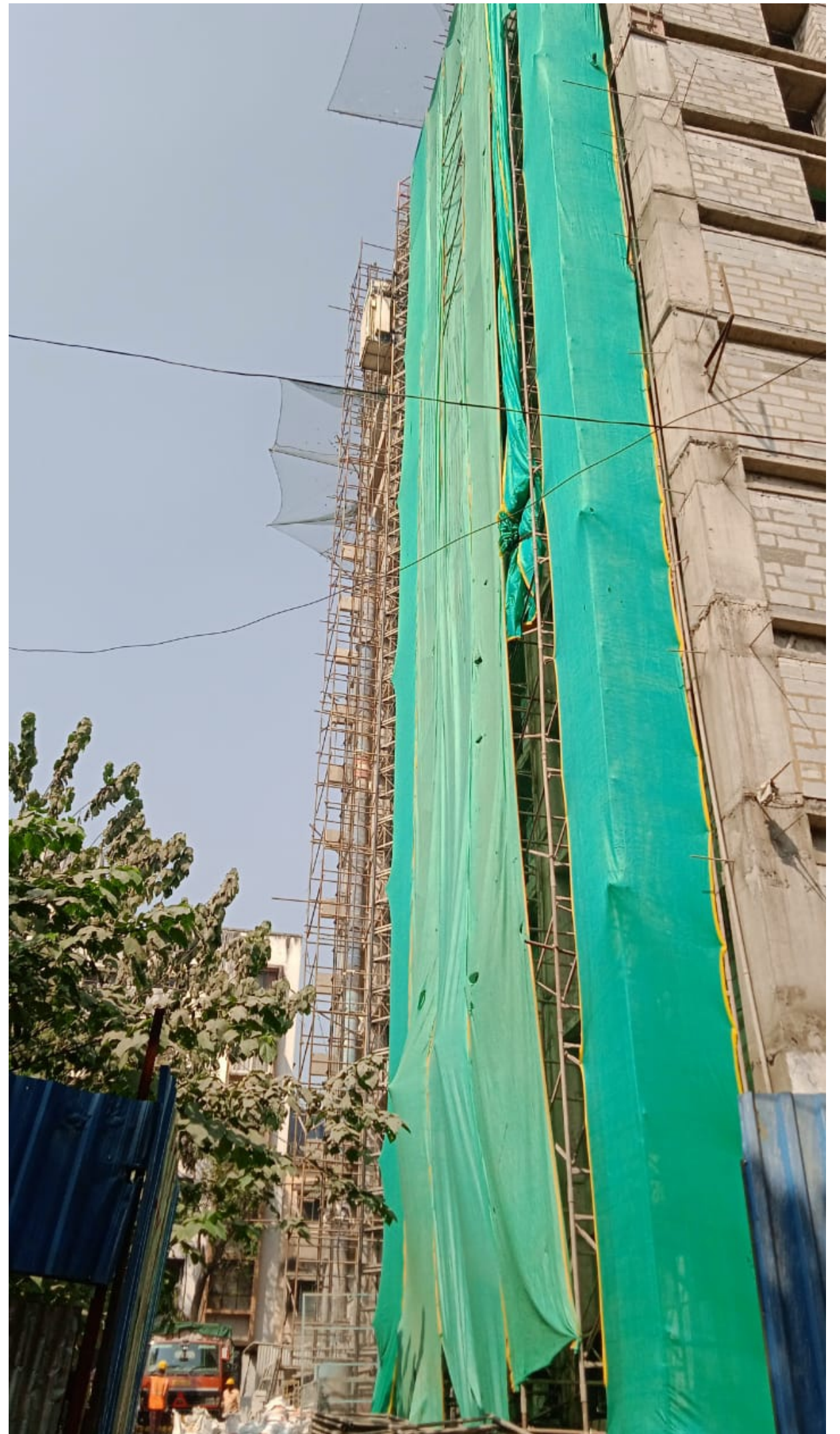
SOUTH SIDE VIEW