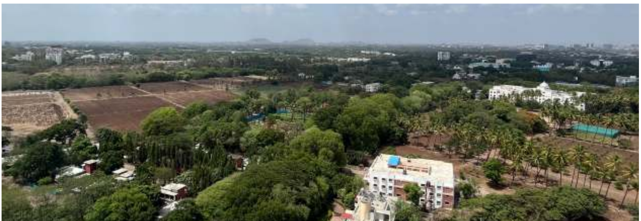
Agriculture college view from 7BS