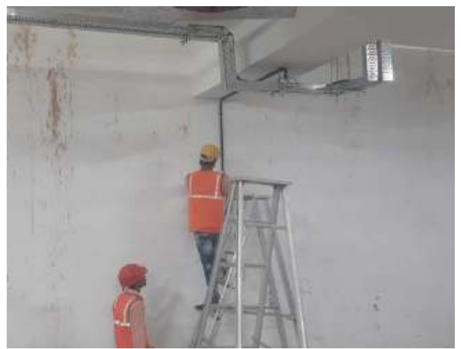
Basement ventilation fans installed, cabling work in progress