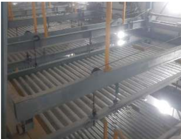
Mechanical parking–work completed