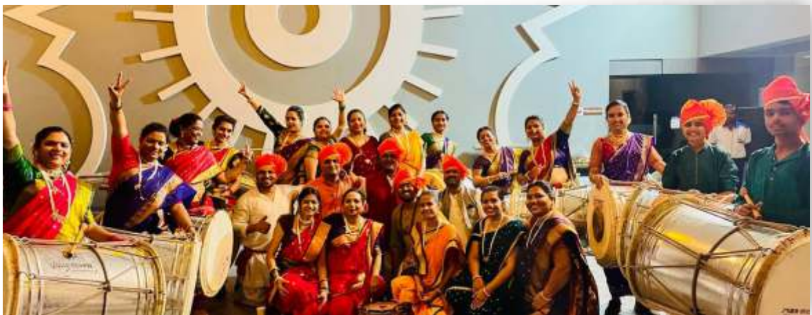
Avon Vista family celebrating Ganesh utsav 2023

We believe in fostering culture and preserving traditions, bringing joy to our residents. Witness the vibrant energy and smiles that light up our community.