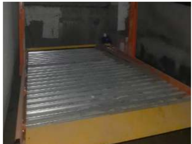
Stack parking–work completed