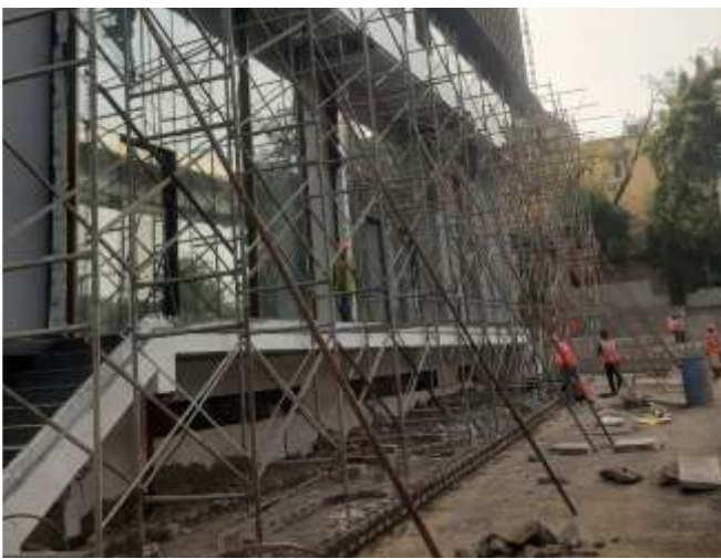
Scaffolding work completed for front side ACP work