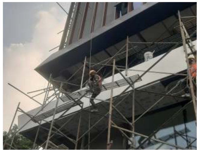
Putty work in progress (Signages band)