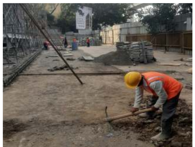
Front side cleaning work