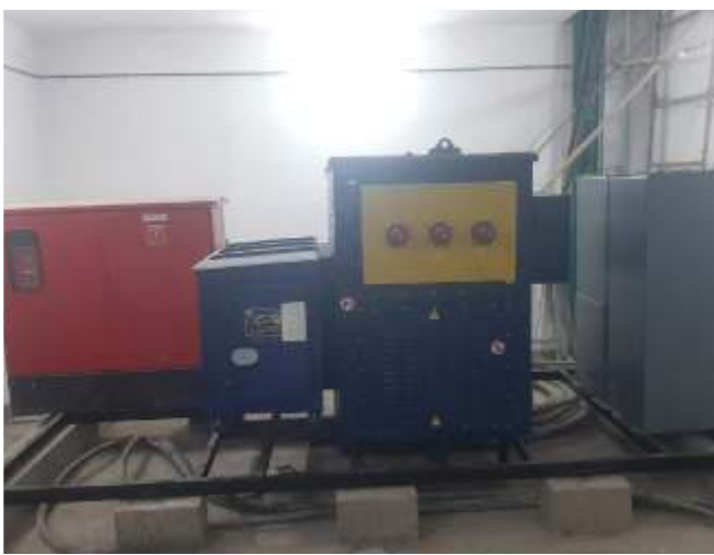
Transformer Installation in progress