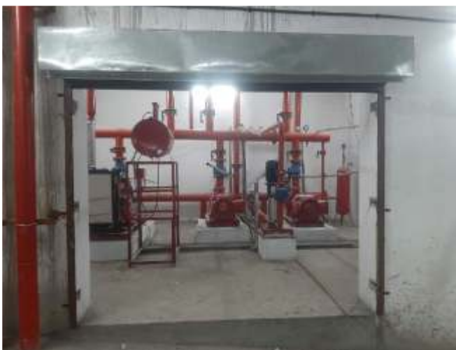
Fire fighting testing completed