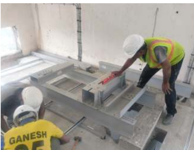
LMR template fixing work in progress (fujitec)