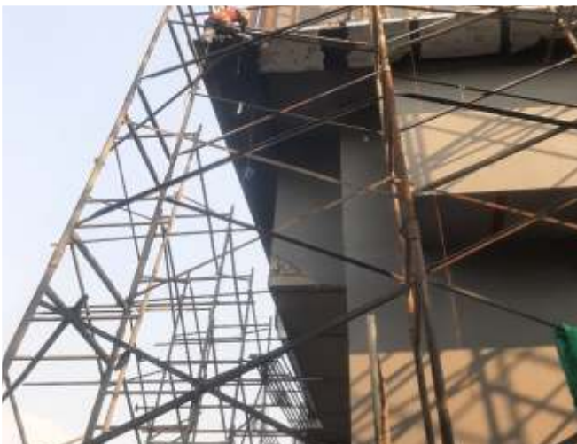
corner signages fabrication work in progress