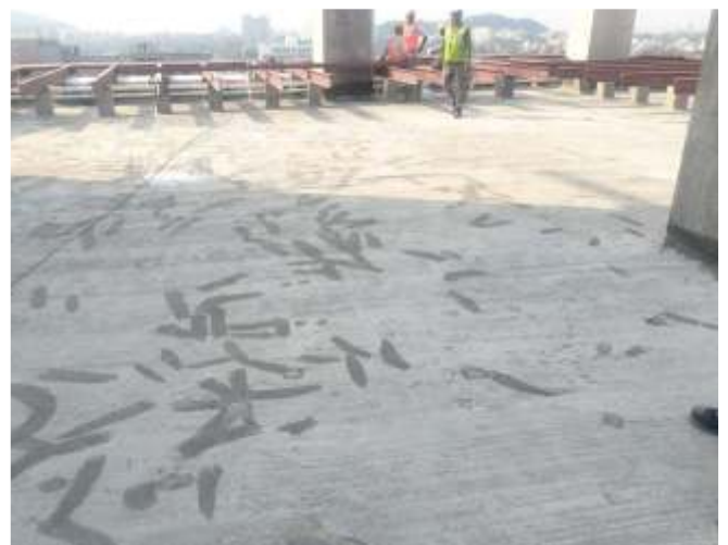
Top terrace crack filling work in progress