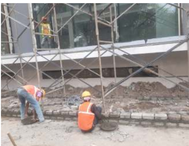
Front side planter blockwork in progress