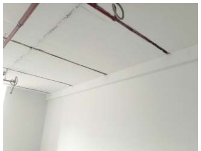
Possession office single coat painting work in progress