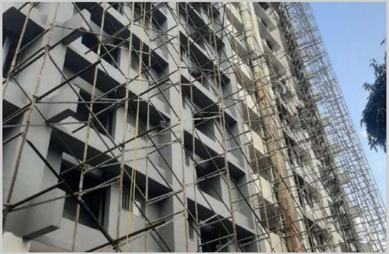
Rear elevation–SRA side facade work in progress