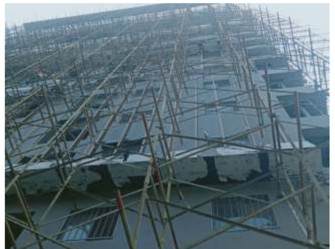
West side fins fixing work in progress