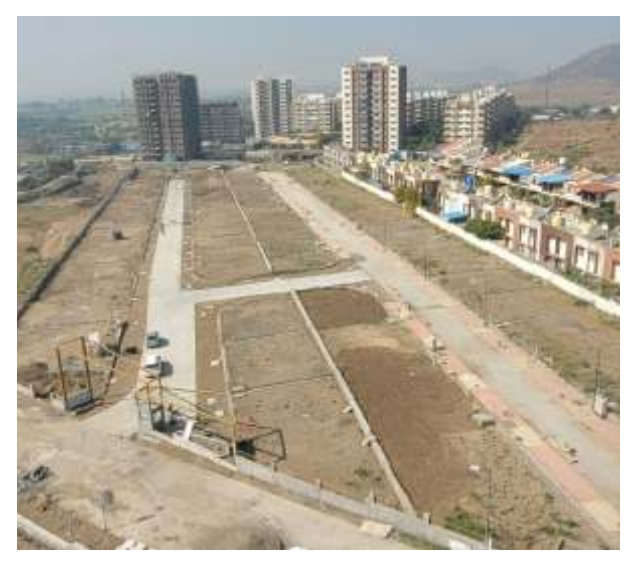
Avasa Grassland - Top View