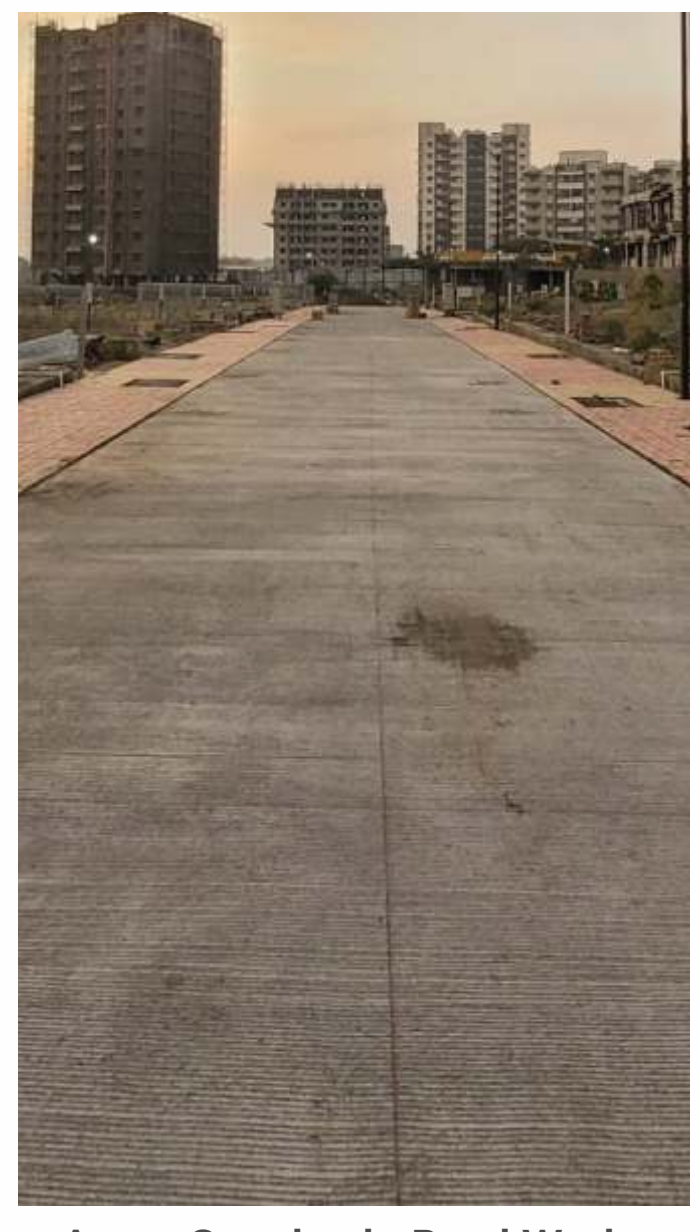
Avasa Grassland - Road Work