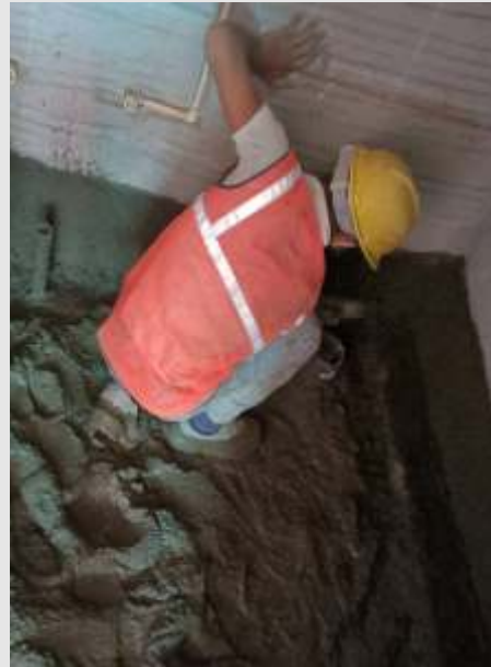
12th floor Toilet Waterproofing Work In Progress