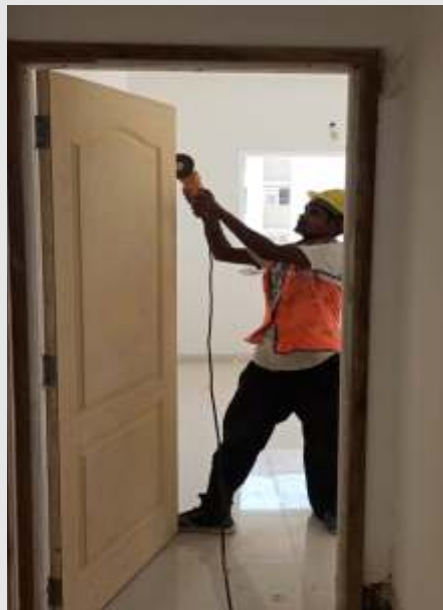
17th floor door shutter fixing Work In Progress