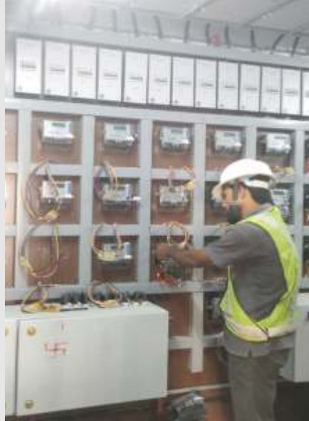
Electrical Meter fixing Work In Progress