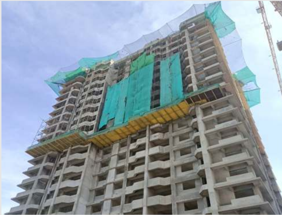
Avon A3 – West Side Elevation