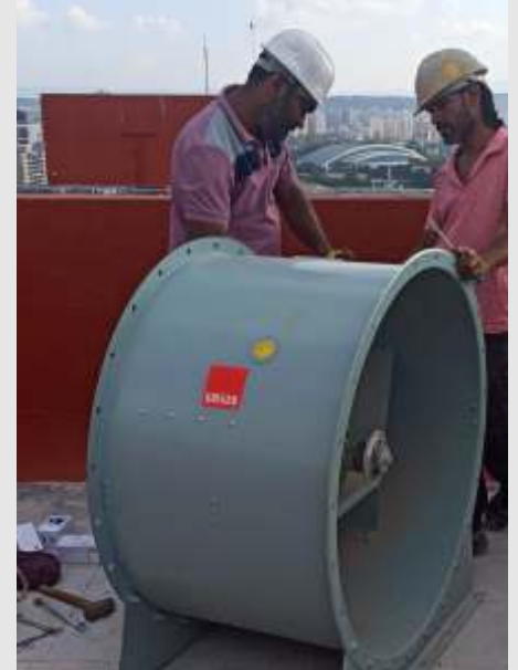
Lift Cladding & Pressurization fan installation work