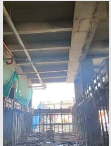
Scooter Parking Slab Work In Progress