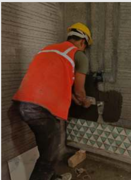
07th floor Toilet Dado Work in progress