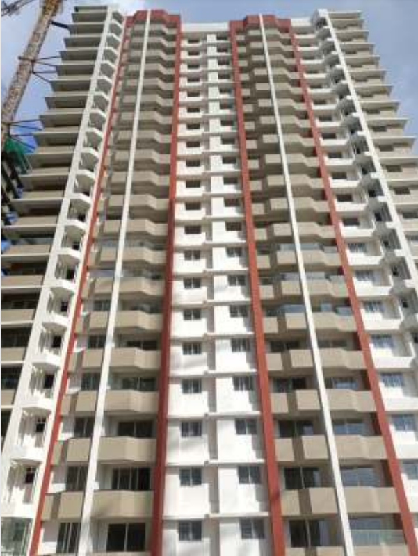
Avon B2 – East Side Elevation