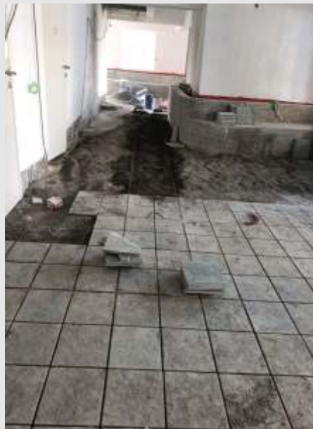
Dev – Shaded Podium Kota Fixing Work In Progress