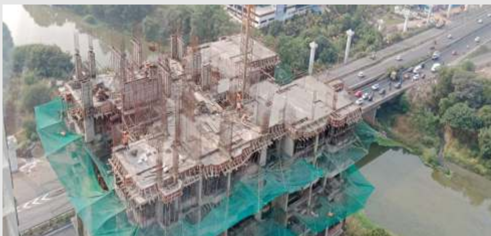
18th Floor Slab Top View