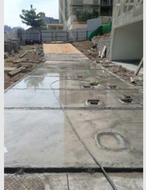
Dev –East side road Trimix work in progress