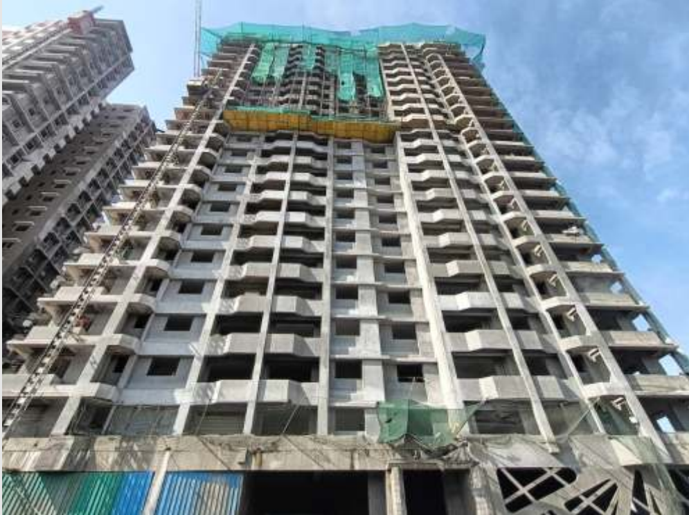
Avon B3 – East Side Elevation