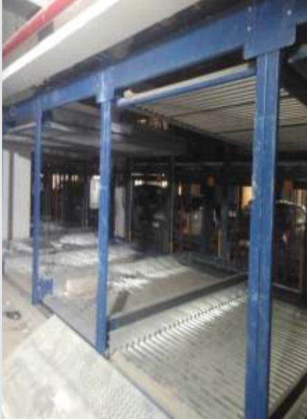
Cp – Pit Parking Pallet Installation Work In Progress