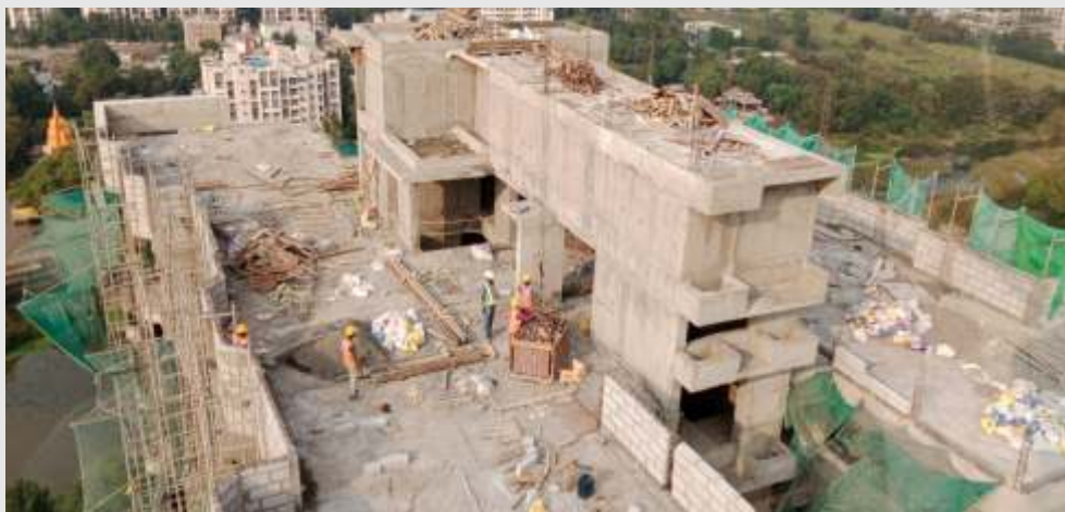
Over Head Water Tank Work In Progress