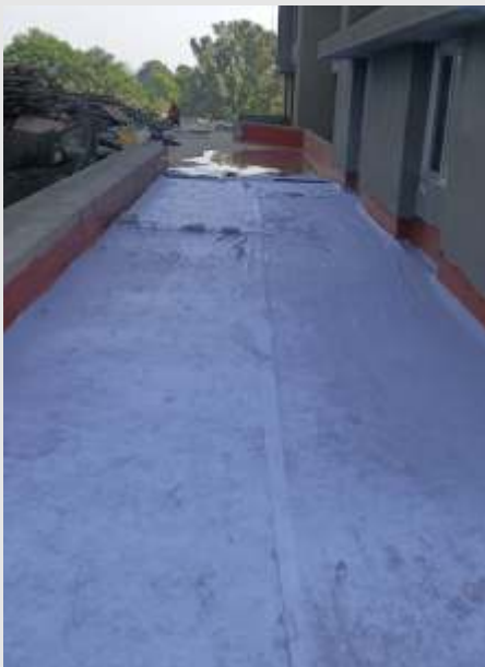
Dev – Central Podium North Side Water Proofing Work In Progress