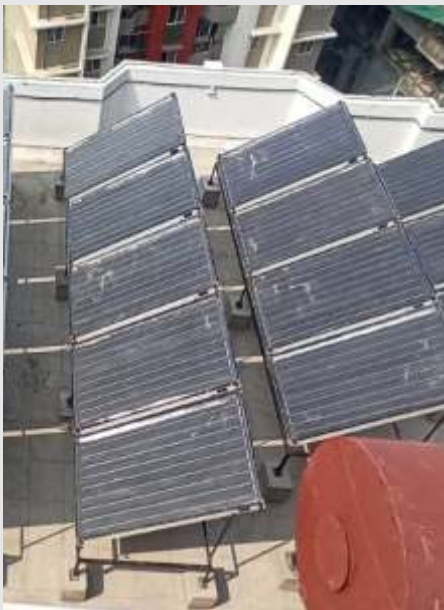
Solar panelling Work In Progress