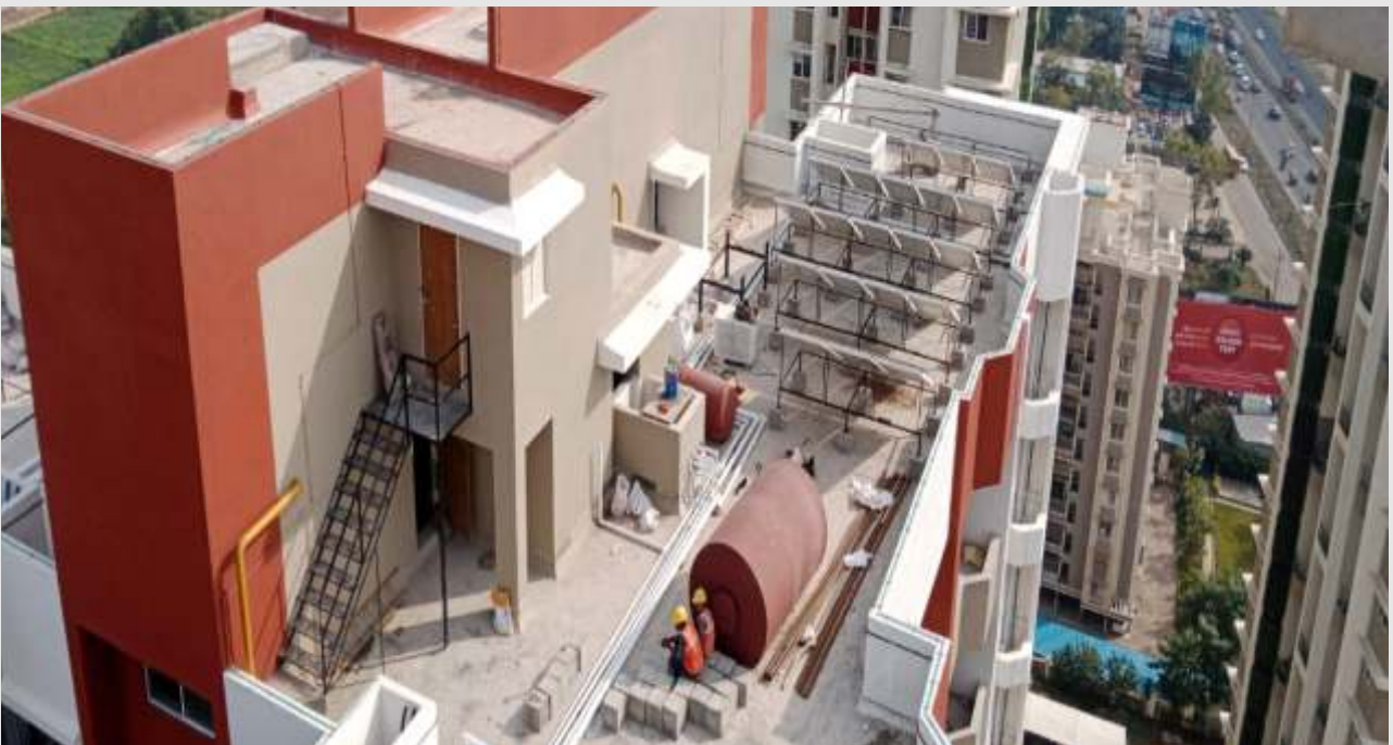
Avon B2 – Top View