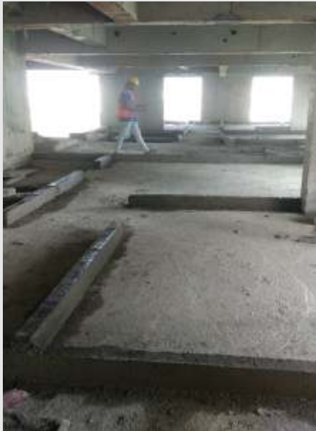
15th floor DPC Work In Progress