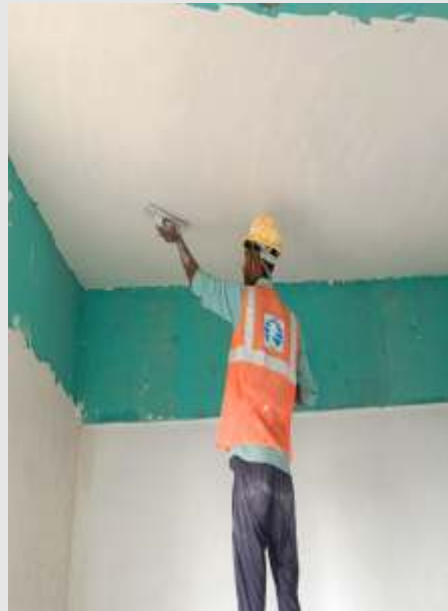
Avon B3 – 14th Gypsum Work In Progress