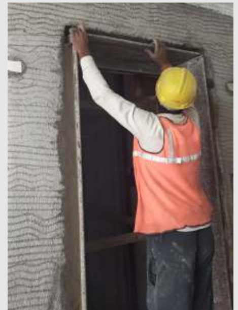
Lift Jam fixing Work In Progress