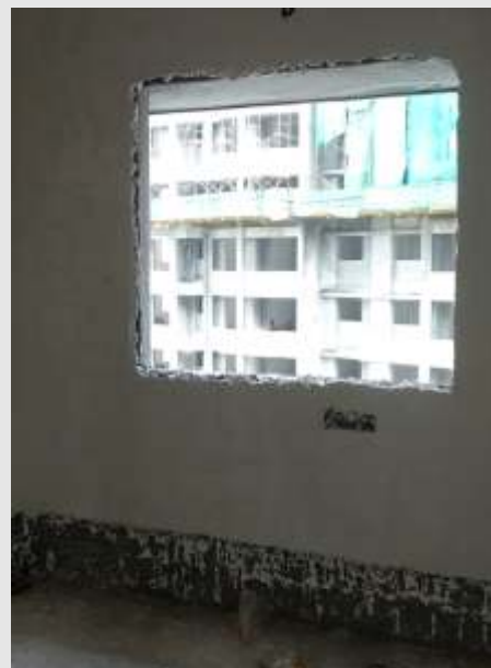
11th floor Gypsum Work In Progress