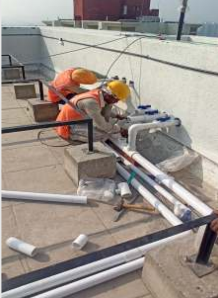
Terrace Looping Work In Progress