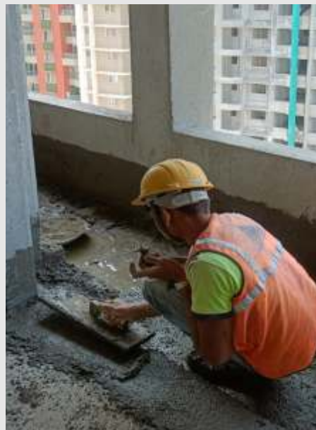
Avon B3 – 10th Waterproofing Work In Progress