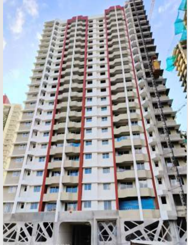
Avon B2 – West Side Elevation