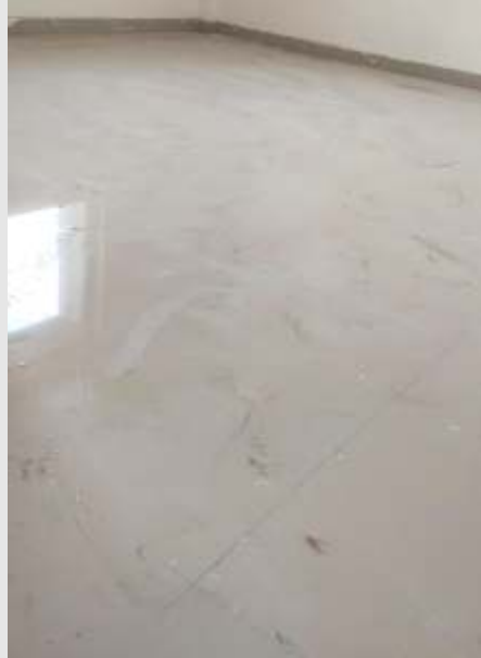
17 th Floor Flooring Work Done