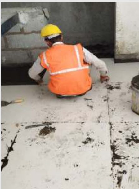
Avon B3 – 3rd flooring work in progress