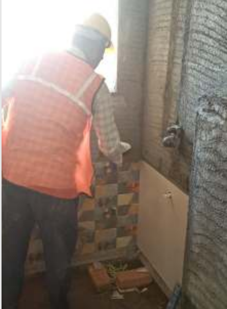
Avon B2 – 15th floor toilet dado & 13th floor flooring work in progress