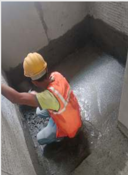
Avon B3 – 6th floor dry balcony Waterproofing Work in progress