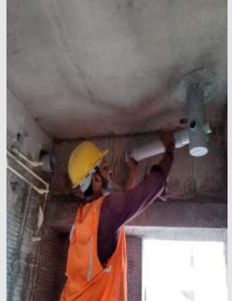
Avon A3 – 10th floor toilet plumbing work in progress