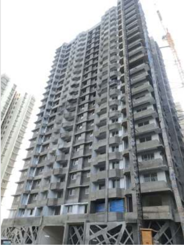
Avon B2 – East Side Elevation