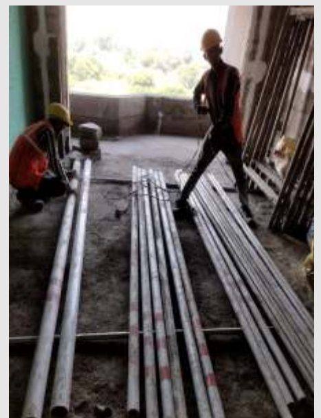
Avon A3 – 5th 8th floor internal firefighting sprinkler fitting in progress