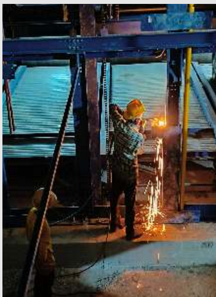
Avon Development – CP module mechanical parking installation work in progress