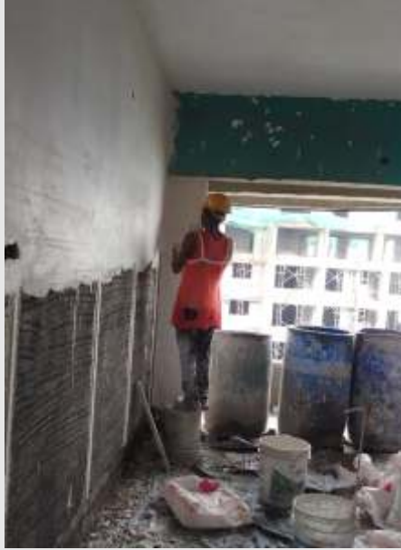
Avon B3 –11th floor Gypsum Work in progress