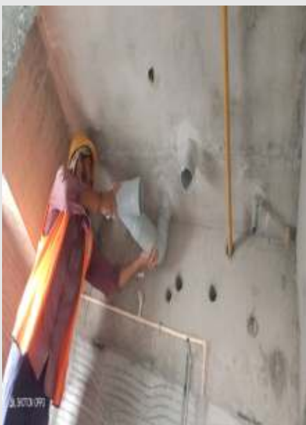
Avon B2 – 21st floor hanging plumbing Work in progress