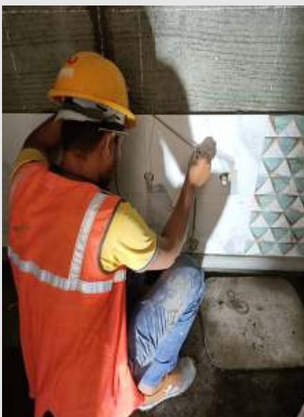
Avon A3 – 2nd & 3rd floor Dado work in progress