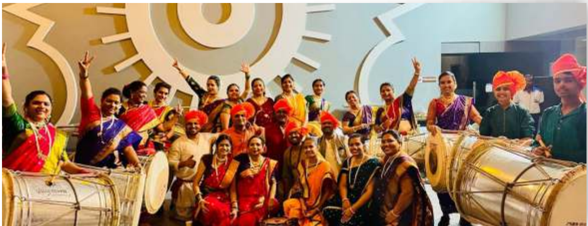
Avon Vista family celebrating Ganesh utsav 2023

We believe in fostering culture and preserving traditions, bringing joy to our residents. Witness the vibrant energy and smiles that light up our community.