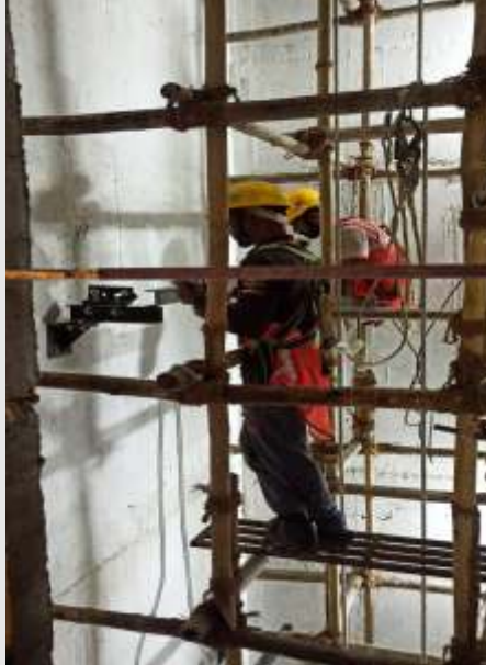
Avon B2 – Lift bracket fixing work in progress