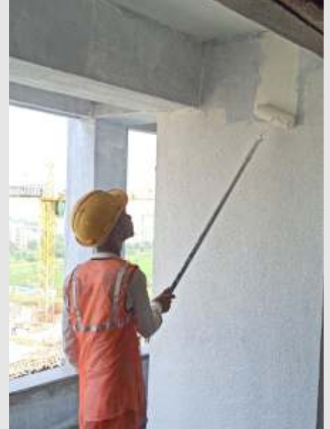
Avon B2 – 19th floor balcony painting work in progress