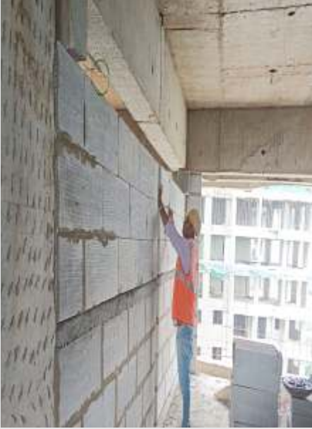
Avon B3 –15th floor blockwork lineout & 14th floor blockwork in progress