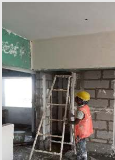
Avon B2 – 19th floor Gypsum Work in progress