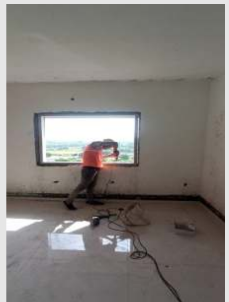
Avon B2 – 16th floor Window frame fixing Work in progress