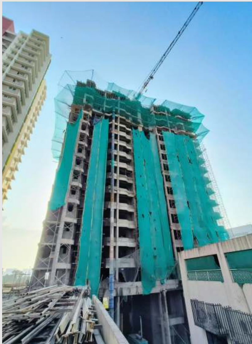
Avon A3 – East Side Elevation