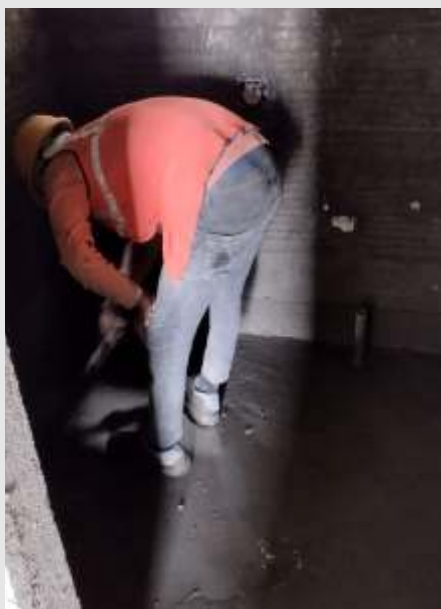
Avon A3 – 9th floor cleaning for waterproofing work in progress