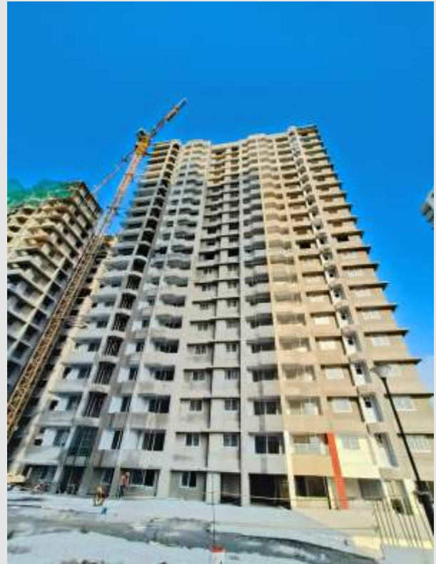
Avon B2 – West Side Elevation