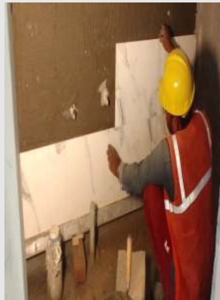
Avon B3 –5th floor toilet dado work in progress