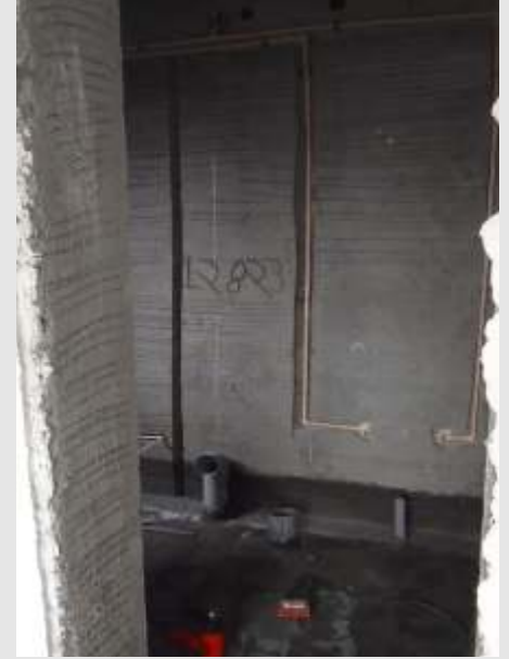
Avon B3 –8th floor toilet plumbing