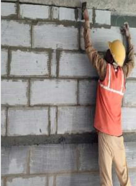
Avon A3 – 13th floor blockwork in progress