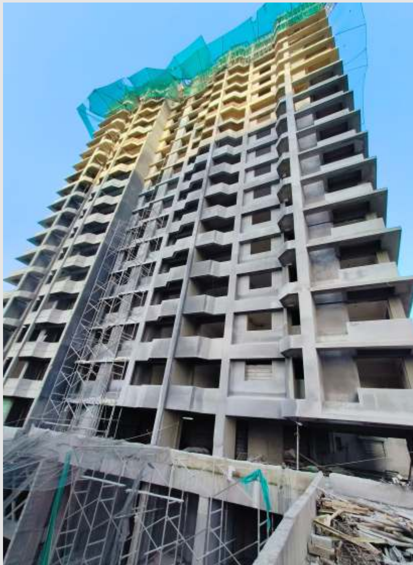
Avon B3 – West Side Elevation