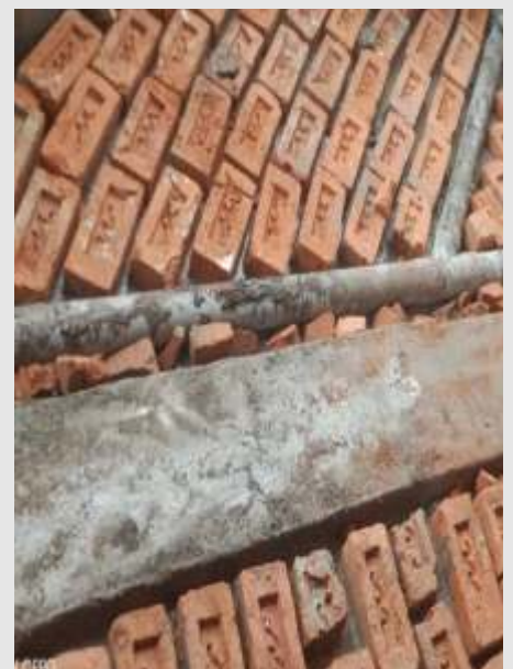
Avon B2 – 20th floor balcony Waterproofing Work in progress