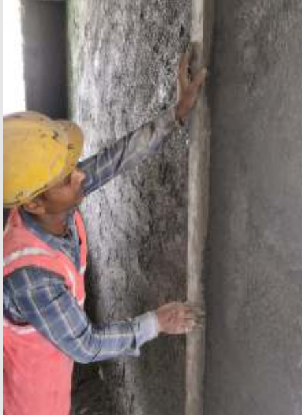
Avon A3 – 11th floor toilet plaster work