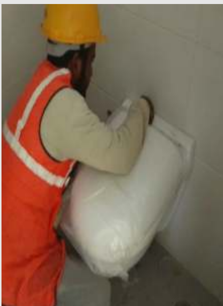
Avon B2 – 8th floor Sanitary work in progress