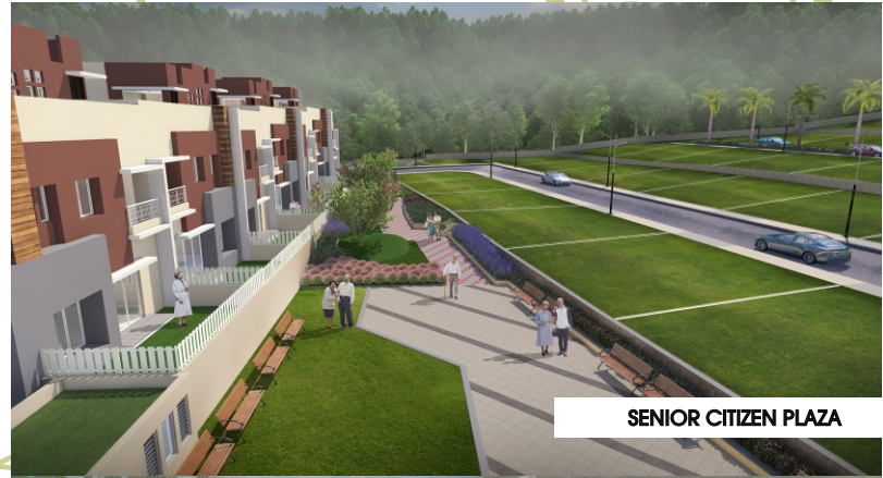
SENIOR CITIZEN PLAZA