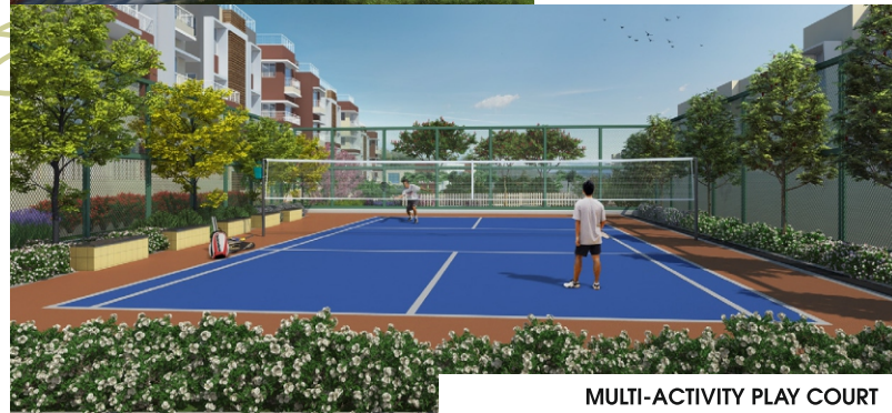
MULTI-ACTIVITY PLAY COURT

Well planned infrastructure with concrete roads, tree-lined walkways & street-lighting, along with ready water and electricity connections make for a life of exceptional convenience. What's best is that you can start using all the amenities immediately after booking your plot irrespective of you living here or no