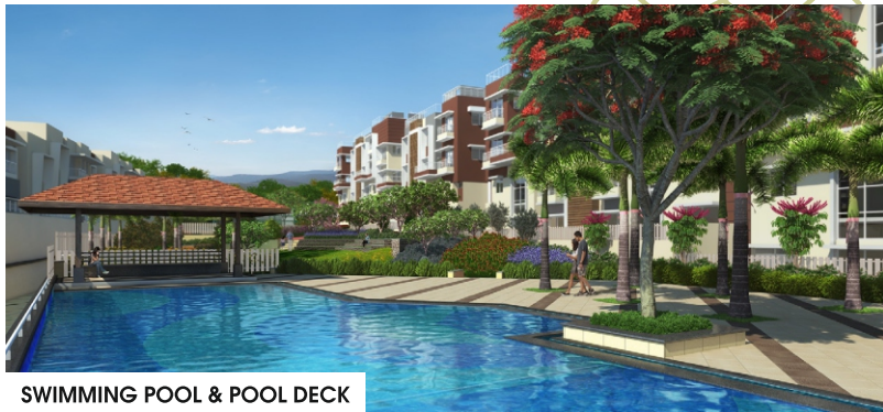
SWIMMING POOL & POOL DECK