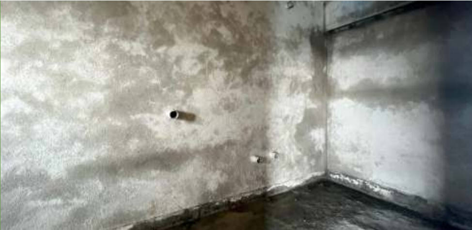
Pump room internal plaster done