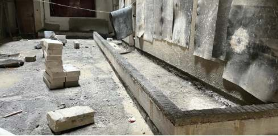
Ground floor lobby planter block done