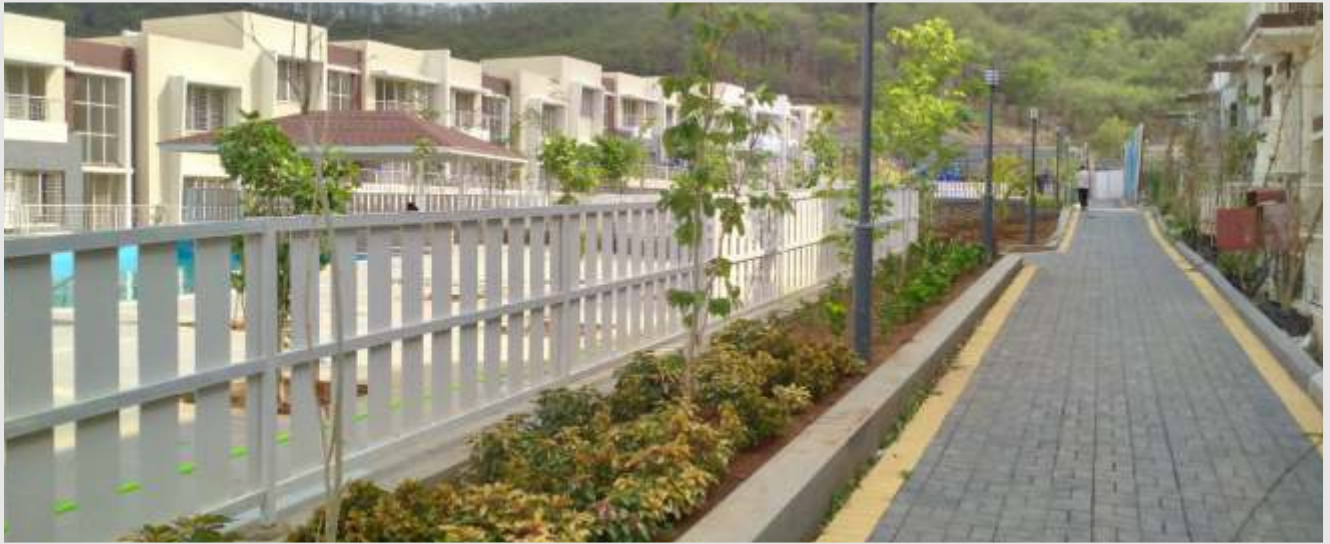
Kutumb Amenity pathway done