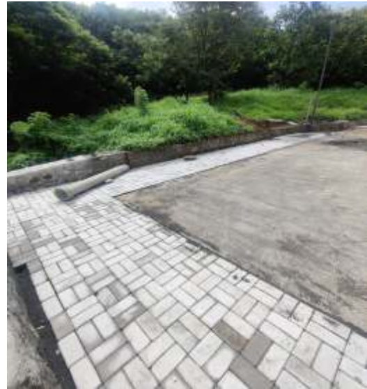
Plot E paver block work completed