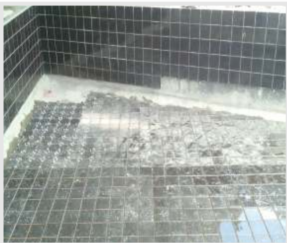
Koi pond tiling work