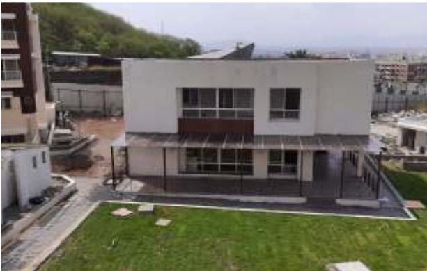
Clubhouse A1 side elevation