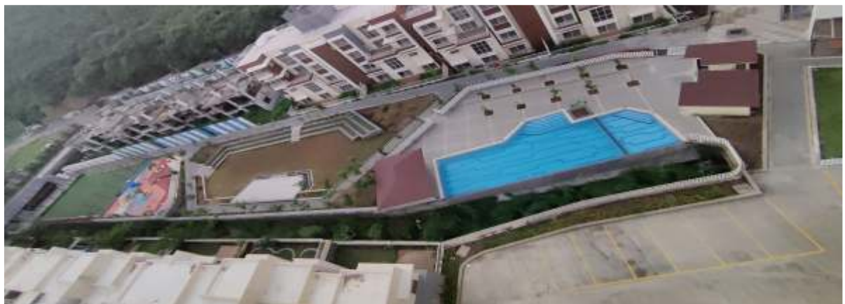
Central Amenity area