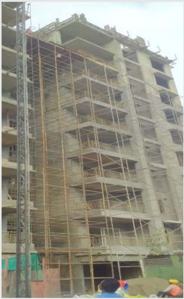
A2 building south side elevation parapet work In progress