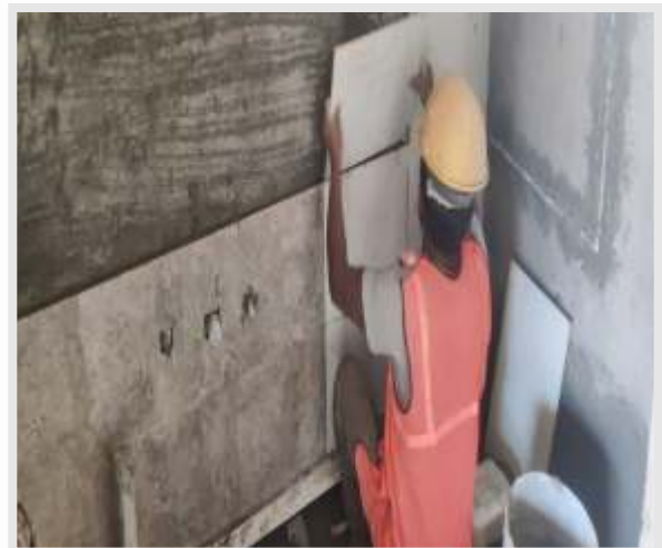
A2 building 3 rd floor toilet dado work in progress