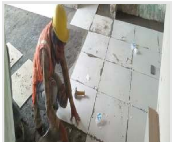
A2 building 2 nd floor flooring work in progress