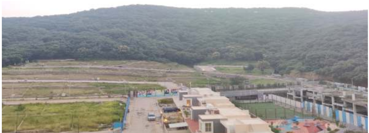
Plot C, D & E Top view