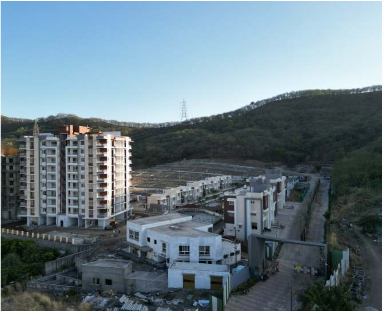
The surrounding view of Kutumb