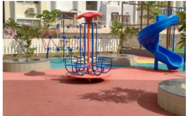
Kids play area