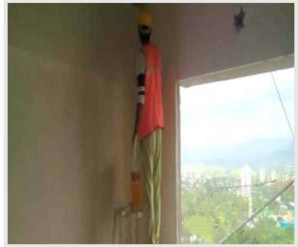
A2 building 7 th floor gypsum work in progress