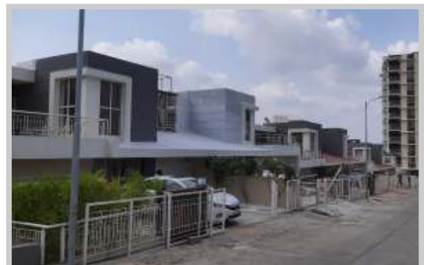
Duplexes Ready to move in/Row houses Possession done