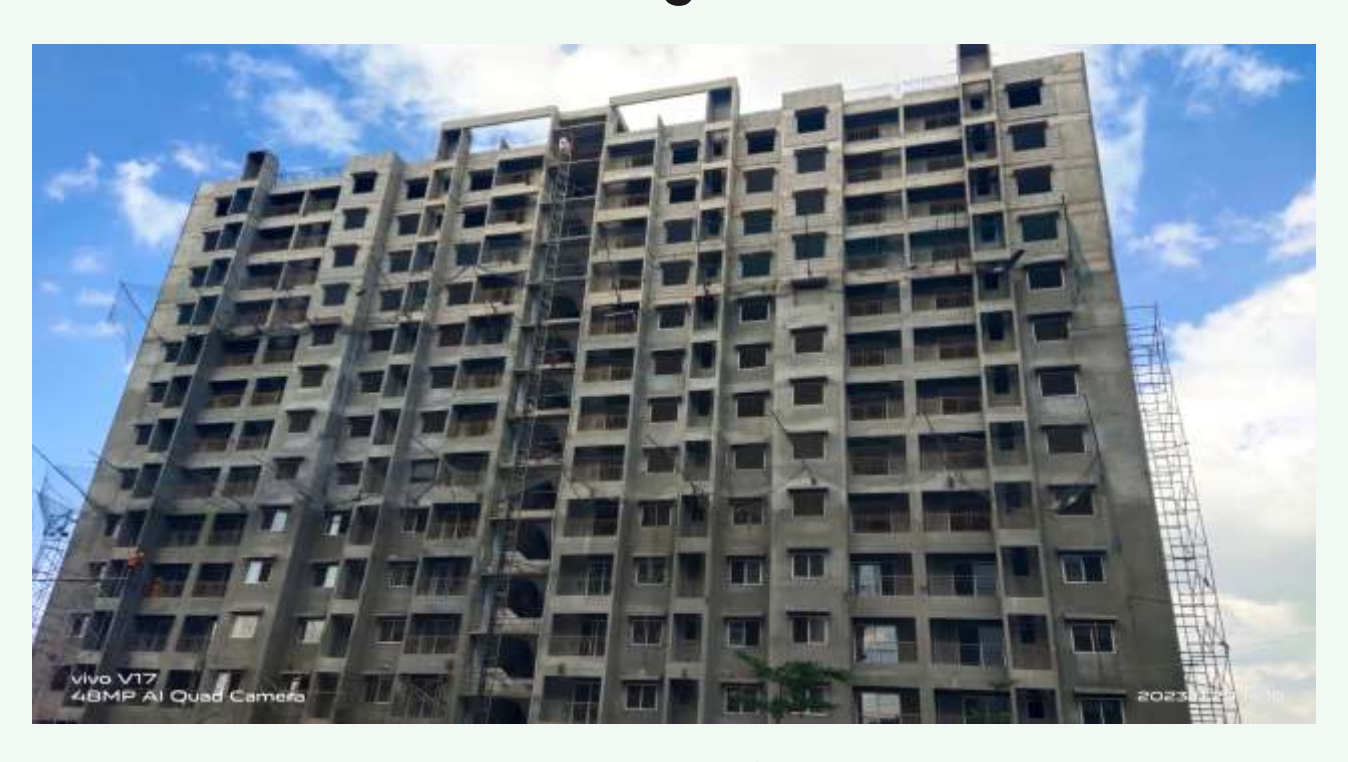
Top terrace plaster work in progress