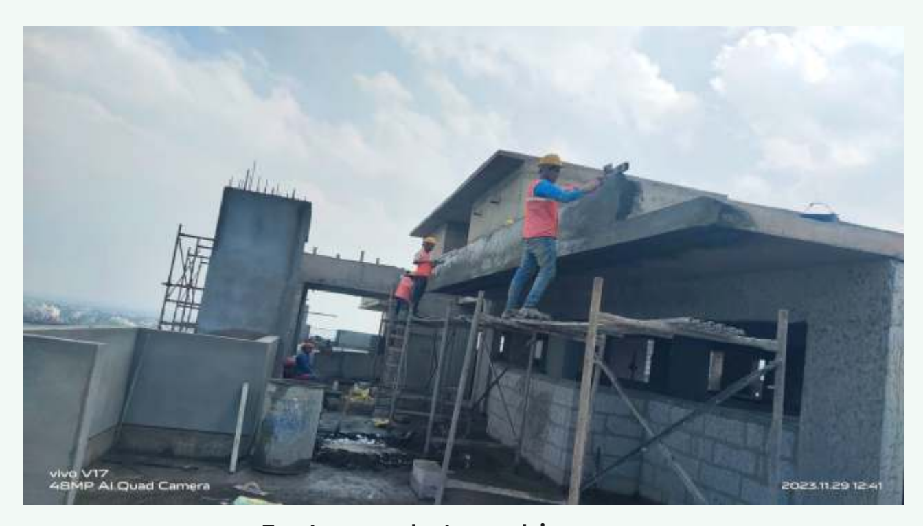
Top terrace plaster work in progress