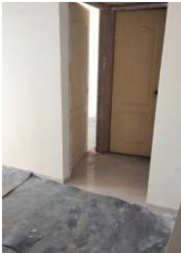
4 th floor door shutter fixing work in progress.