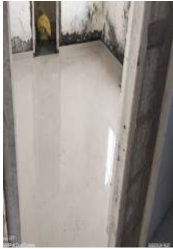
9 th Floor flooring work in progress