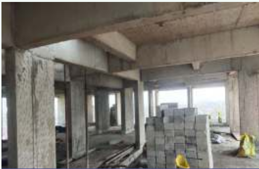
14 th Floor block work in progress