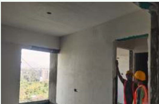
12 th Floor Gypsum work in progress.