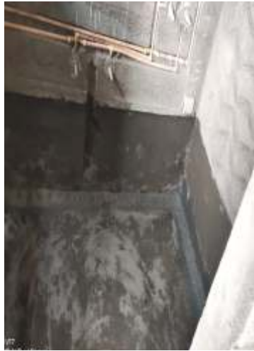
12 th Floor waterproofing chemical work in progress