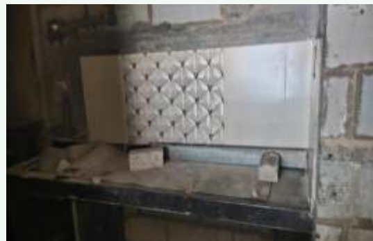
12 th Floor kitchen platform + Dado Work in progress.