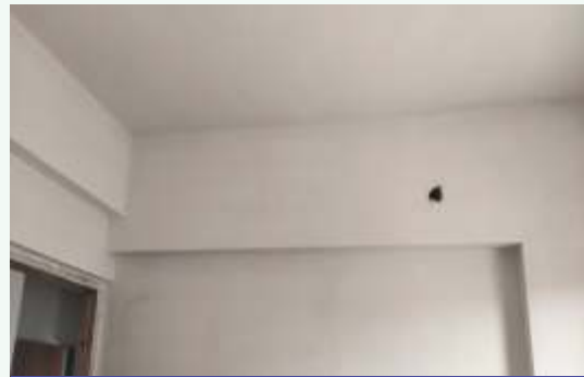
6 th Floor wall putty work in progress.