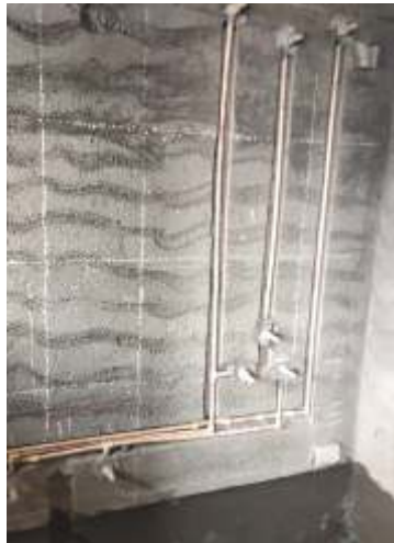
12 th Floor concealed plumbing work