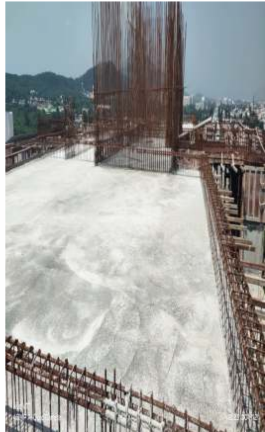
'C' Building OHWT bottom slab casting completed