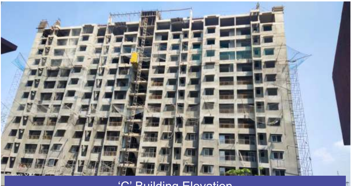
'C' Building Elevation