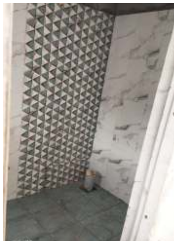
9 th & 10 th Floor toilet + dado work in progress.