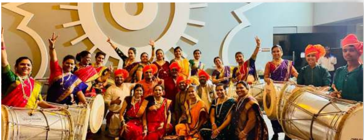
Avon Vista family celebrating Ganesh utsav 2023

We believe in fostering culture and preserving traditions, bringing joy to our residents. Witness the vibrant energy and smiles that light up our community.