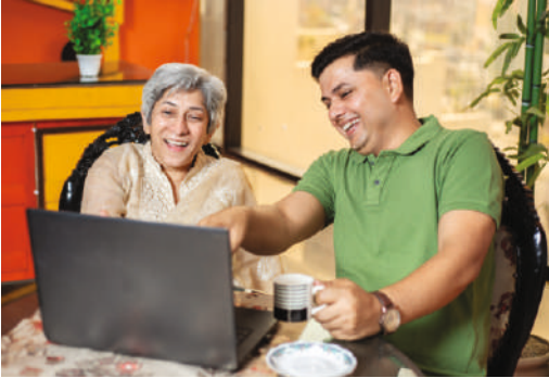
ACCOMPANYING YOUR SENIORS IN THE COMFORT OF YOUR HOME

Togetherness grows when things get taken care of without any hassles. Primus ensures absolute freedom from worries, chores, cooking, or daily errands. Be it tea at your table when you want or whenever your elders need any medication when you are away. Everything is taken care of in a professional way.