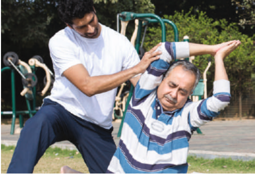
ENGAGING PHYSICAL ACTIVITIES