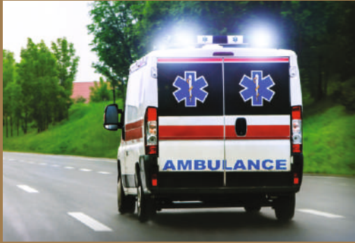
AMBULANCE ON CAMPUS