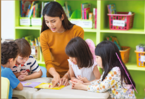
DAY CARE CENTER