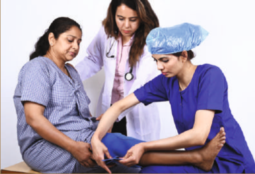
24X7 MEDICAL ASSISTANCE