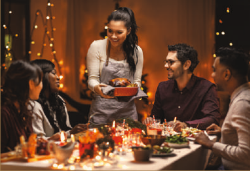
IN-HOUSE DINING HALL WITH ALL INDIAN CUISINE